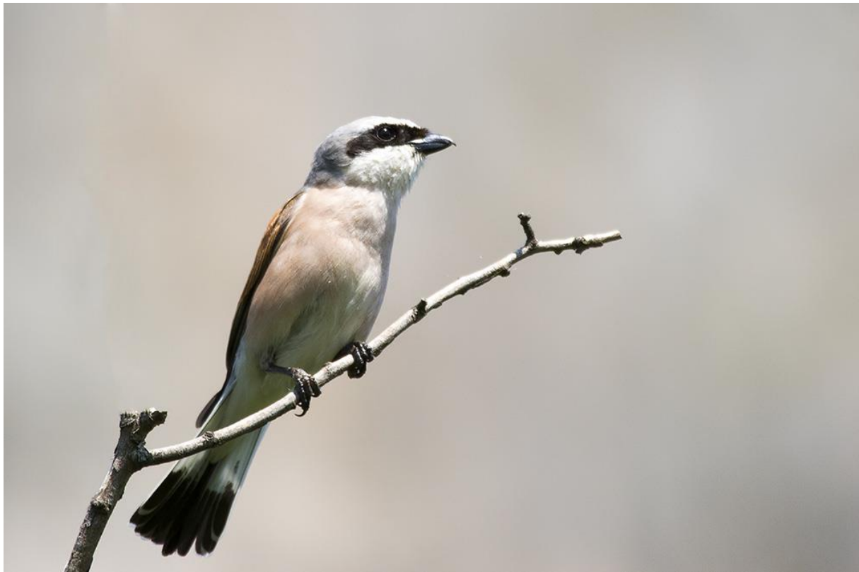
Red-backed Shrike (Sándor Borza)

Lesser Grey Shrike Lanius minor : Uncommon bird in Transylvania, we had only one observation on the last day.