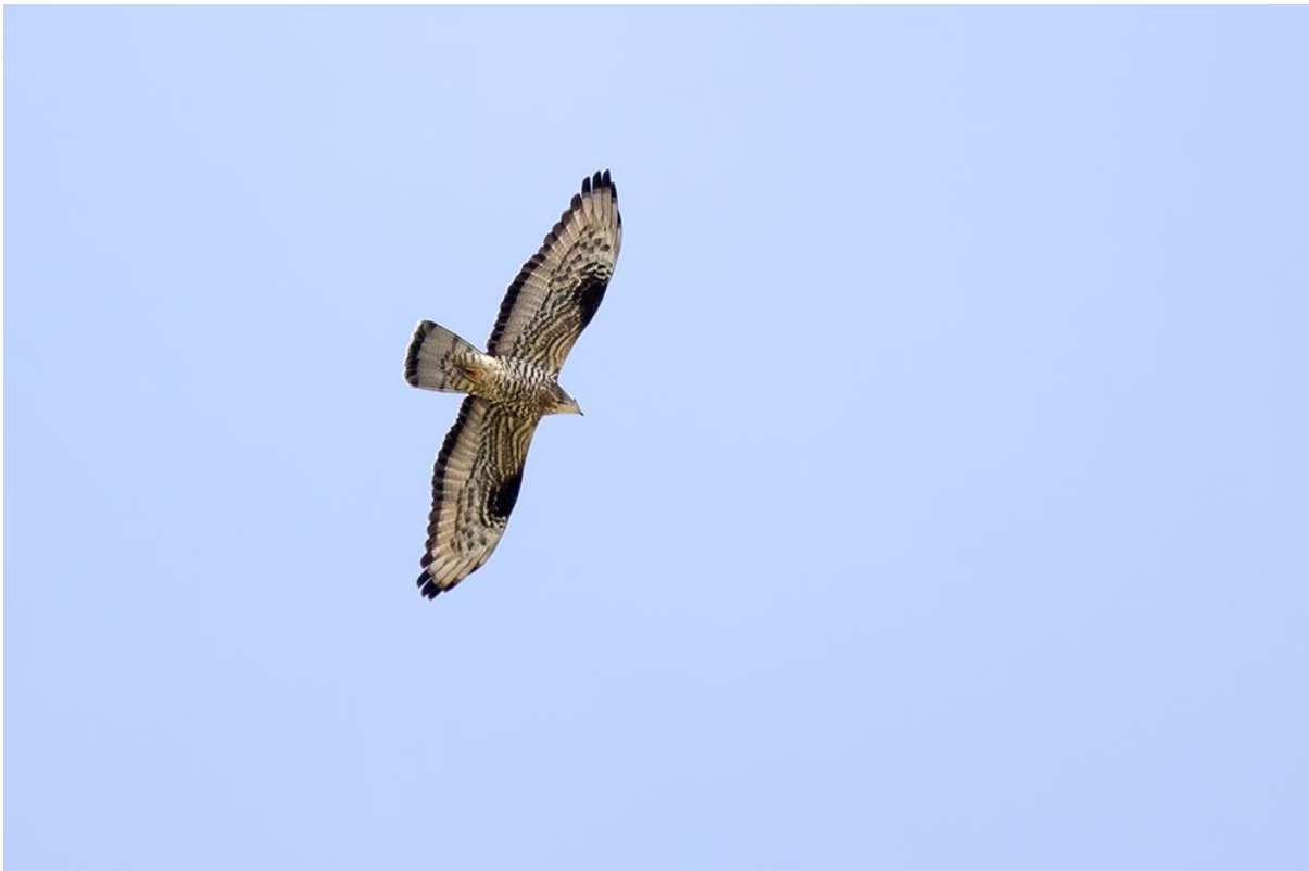
European Honey Buzzard

European Honey Buzzard Pernis apivorus : We recorded three birds on the tour.