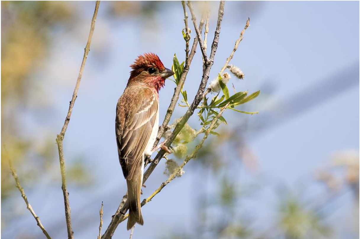
Male Common Rosefinch

Eurasian Bullfinch Pyrrhula pyrrhula : We could see several individual in the Bucegi region. Common Crossbill Loxia curvirostra : We had a fantastic view in the Hargita Mountains. Common Rosefinch Carpodacus erythrinus : One male bird was seen very well in the Hargita region.