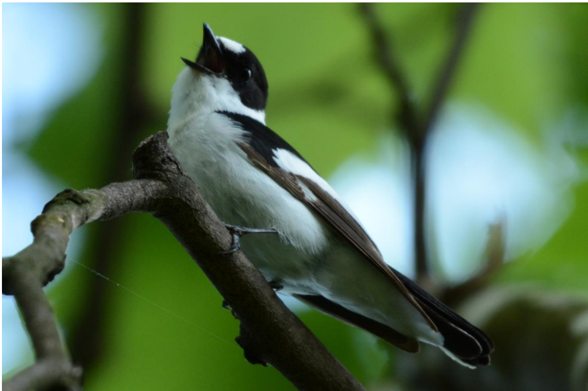
Group taking landscape photos in the Bucegi Mountains and Collared Flycatcher (tour participant Stephen Bolger).