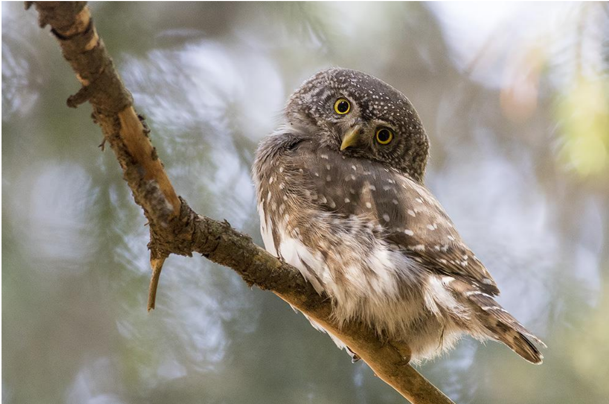
Eurasian Pygmy Owl (Sándor Borza)