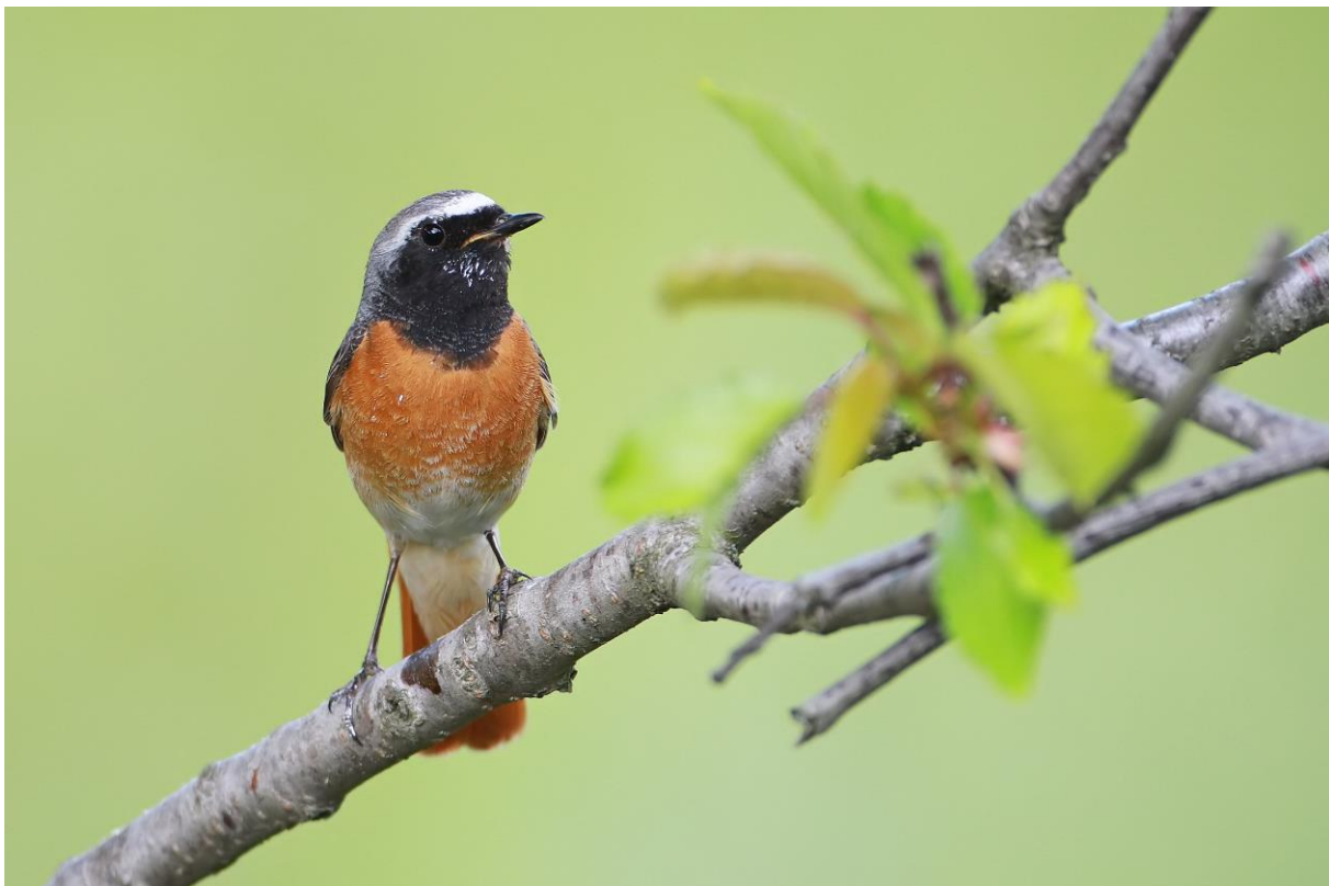
Common Redstart was seen in the Hargita area

Common Redstart Phoenicurus phoenicurus : One bird was seen in the top of Hargita Mountain.