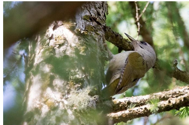
Male Red-breasted Flycatcher (left) and female Grey-headed Woodpecker in the Bucegi Mountain (Sándor Borza)