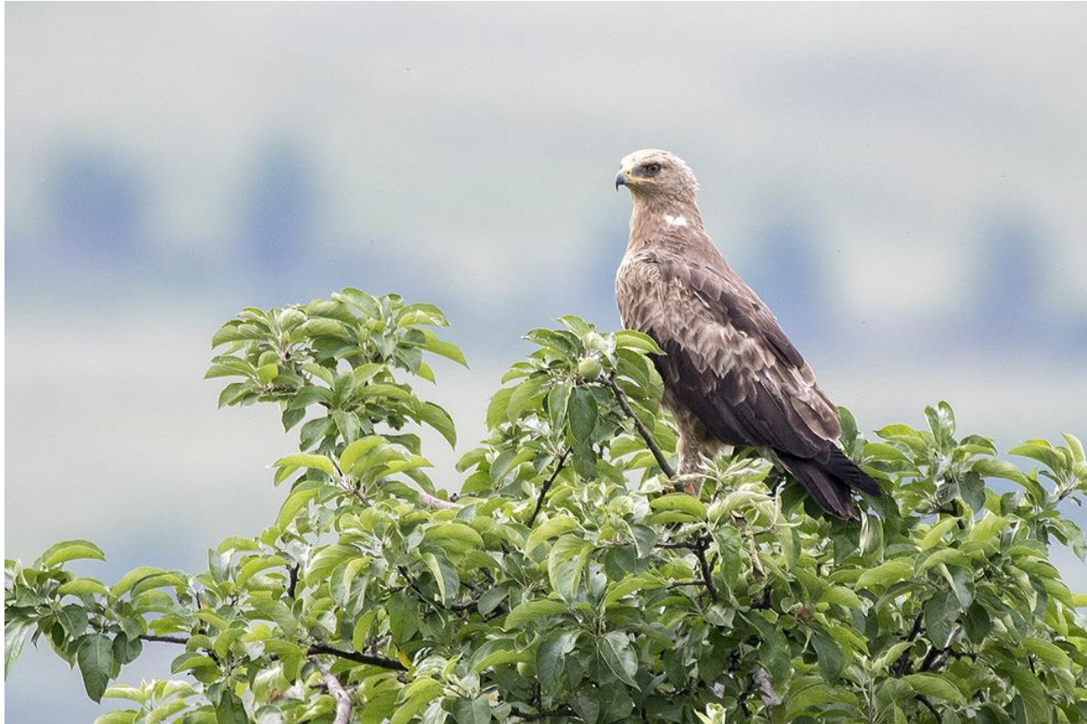
Lesser-spotted Eagle (Sándor Borza)