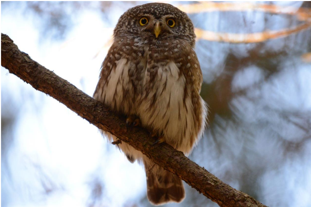
Eurasian Pygmy Owl (tour participant Stephen Bolger)