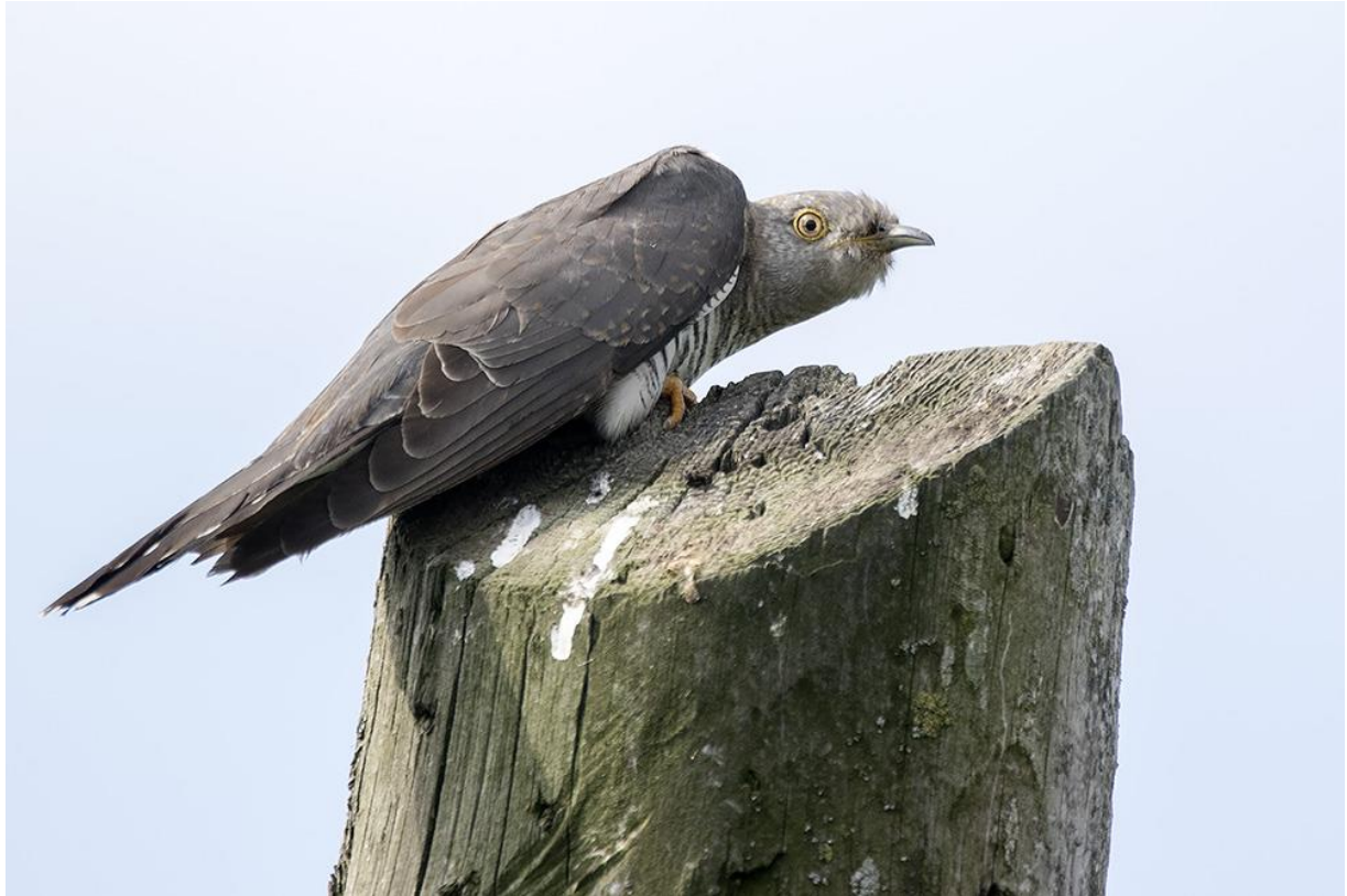
Common cuckoo (Sándor Borza)

Common Cuckoo Cuculus canorus : Common but the best views were at Szentpál Fishponds.