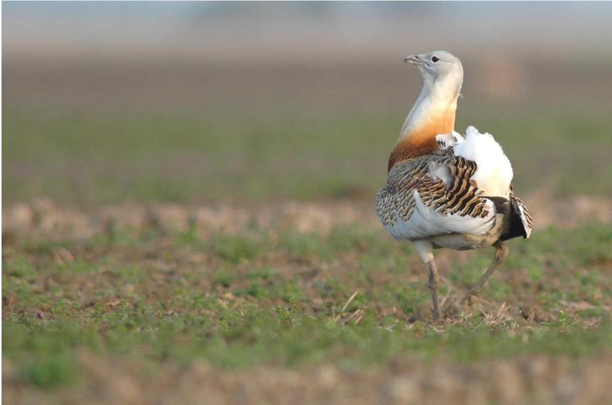
Magnificent Great Bustard in the Hortobágy National Park (János Oláh)

was late spring, the display time was coming to its end, but males are usually still hanging around these places. After a very short walk we spotted seven males of these magnificent birds. They are very shy, but as we had some reed cover we could have good views of them as they were walking around. It is indeed a fantastic bird and the heaviest flying bird on earth! As we still had some time to visit another buffalo grazed wetland where new birds included a nice perched Hobby and a Whinchat on a wire: the last birds of the day. It was a full-action-packed day with great birds!