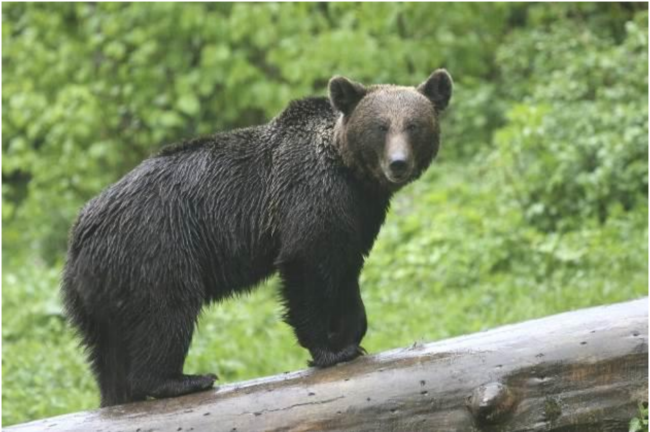
One of the Brown Bears in the rain

we returned to our hotel as it started to rain again and we decided to have a little rest instead of going out in the heavy rain. Later on we took a short walk around though it was still raining. A few White-throated Dippers – one adult, but more freshly fledged juvenile – were seen along the nearby streams. However an exciting activity was still coming up for the evening: Carpathian Brown Bear watching! Sakertours now operates several bear hides in the region and we picked one which had good activity recently. It was still raining but after a short drive and a little walk we got to the hide. The Brown Bear population is strong and stable in the surrounding mountains, but one has a small chance to meet a bear without a good hide. Though we had to wait about an hour without any bears, eventually they arrived and during the evening we saw no less than seven different bears: small young females, older females and also two huge males. Five bears were the maximum in front of us at one time. It was an amazing evening a fine ending to our somewhat rainy day.