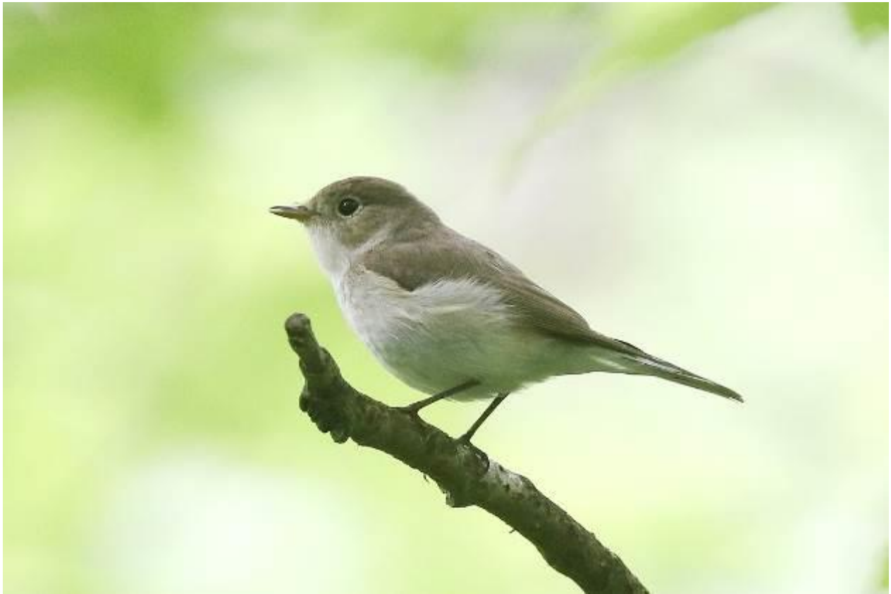
Immature male Red-breasted Flycatcher

spotted Woodpecker, and a Common Redstart here, and also Collared Flycatchers were around. Finally we located two immature male Red-breasted Flycatchers as they were singing and both of them were close enough to provide great views. We also had a Black Woodpecker flying parallel to the road.