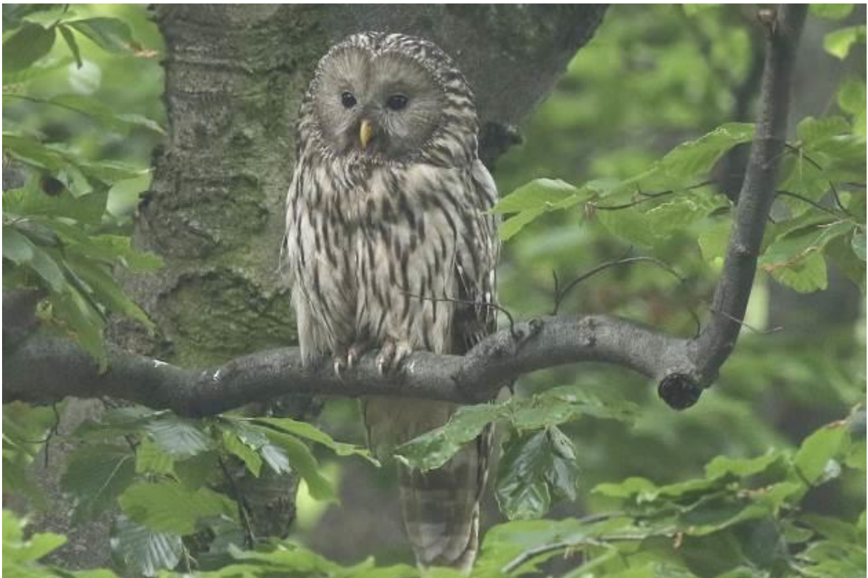
The impressive female Ural Owl

Following a short ride by bus we walked a few hundred meters through dense forest to reach a more open woodland. Here we had two nice Middle-spotted Woodpeckers carrying food for their chicks as well as many Great-spotted Woodpeckers. We didn't have to wait too much until we spotted our main target here, a fantastic Ural Owl, of which we had extremely good and prolonged views! For sure, this species was on the wish list of many of the tour participants. After we left the area we drove up on a dirt road to walk into a similar beech forest. First we had a pair of Lesser-spotted Woodpeckers on a dead tree, a few singing Wood Warblers, a Black Woodpecker calling and flying overhead and more Collared Flycatchers were seen too. We spent some time in the territory of the scarce White-backed Woodpecker because for unknown reason they abandoned their nest hole we found a few days ago at this location. If the exact breeding hole is not known they can be really difficult to find in the canopy as they are really shy and wary this time of the year. The weather turned against us as and it started to rain. However, after a while we heard the picking of a woodpecker, which turned out to be a White-backed, but unfortunately it disappeared before most people could have a glimpse of it. We kept trying which was rewarded by short flight views for some of us, but that was all. Not very satisfying after much effort.