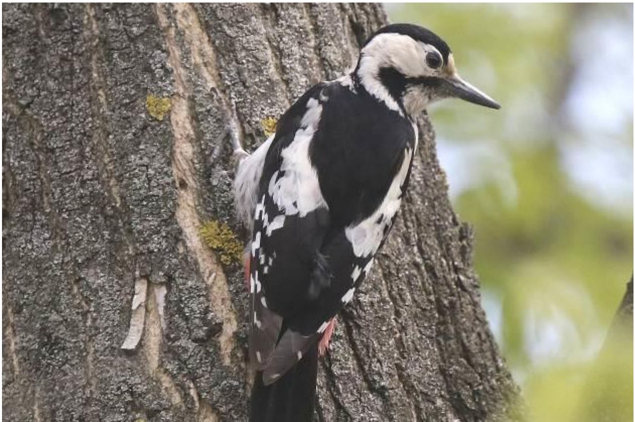
Syrian Woodpecker is a village bird in Hungary

From this bird reach area we drove to the BÍbic nature Lodge in Balmazújváros, to have lunch. The lodge itself is very well located and from its terrace we had an overview of an alkaline pond with grassland around and local breeds of different grazing livestock (we stay here on our autumn tours but in spring it is full with our photography tours). On the pond, among others a few Black-necked Grebes and Ferruginous Ducks were nice to see. On the islands Pied Avocets, Black-winged Stilts and Little-ringed Plovers were sitting on their nests. A small street nearby gave us two long and close views of Syrian Woodpeckers – a typical village bird, always found away from real forests. After a fine meal, we visited a grassland area where Red-footed Falcons were hunting around and nice breeding plumage Ruffs were feeding in the shallow water. We thoroughly checked the wet parts of the area, and we managed to flush one Great Snipe which made a big round around us while we could have a really good view of this scarce species. While we were driving on a rough little road, we stopped by a similar habitat, where we managed to find another Great Snipe, along with plenty of Red-throated Pipits. On a bush, a nice Long-eared Owl was found right in the open, and a male Montague's Harrier also turned up. By a ruined farm building we saw two Barn Owls of the race guttata .