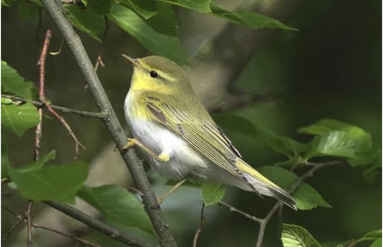
Wood Warbler in the Zemplén-hill (tour participant Björn Johansson)

Blackcap Sylvia atricapilla : We heard them singing on seven days, but we saw them only on a few occasions.