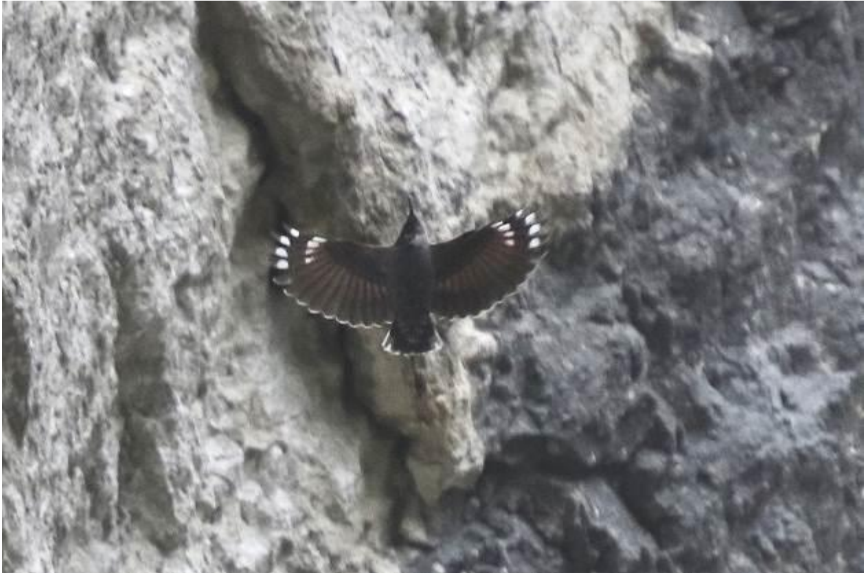
Wallcreeper flying above our head (tour participant Björn Johansson)

were looking for the special Wallcreeper. You can walk along the cliff face or sit around (the latter is better considering the traffic) both strategy can be good. We opted for the sitting around and after about 10 minutes the first bird appeared quite high, flying from one rock face to the other. Later on no less than three birds were flying around often chasing each other along the cliffs. From time to time, they landed on the cliffs, and we had time to set our scopes on them. So eventually everyone had great look of these special birds not only in flight but on the rocks as well. At the background a White-throated Dipper family entertained us as the adult were hunting and swimming in the water, while the juveniles were waiting for them on the nearby rocks.