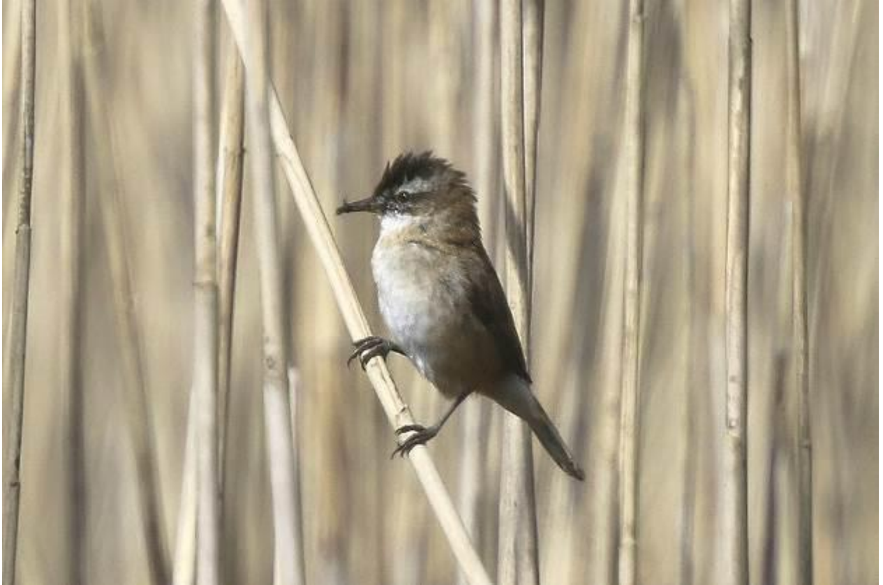
Always great to see a Moustached Warbler in the open

A grassland area gave us a soaring Long-legged Buzzard (a rare breeder of the Hungarian grasslands) and also a Hobby and a Hoopoe. Our next stop was by some reservoirs where we had our picnic lunch. We had no time for checking the huge lakes thoroughly, but five Red-necked Grebes were spotted among the many Greater-crested Grebes. We also saw singing Ortolan Buntings and a Tawny Pipit made a short appearance too. A soaring Short-toad Eagle gave better views than the one in the Zemplén Hills and was a very welcome addition!