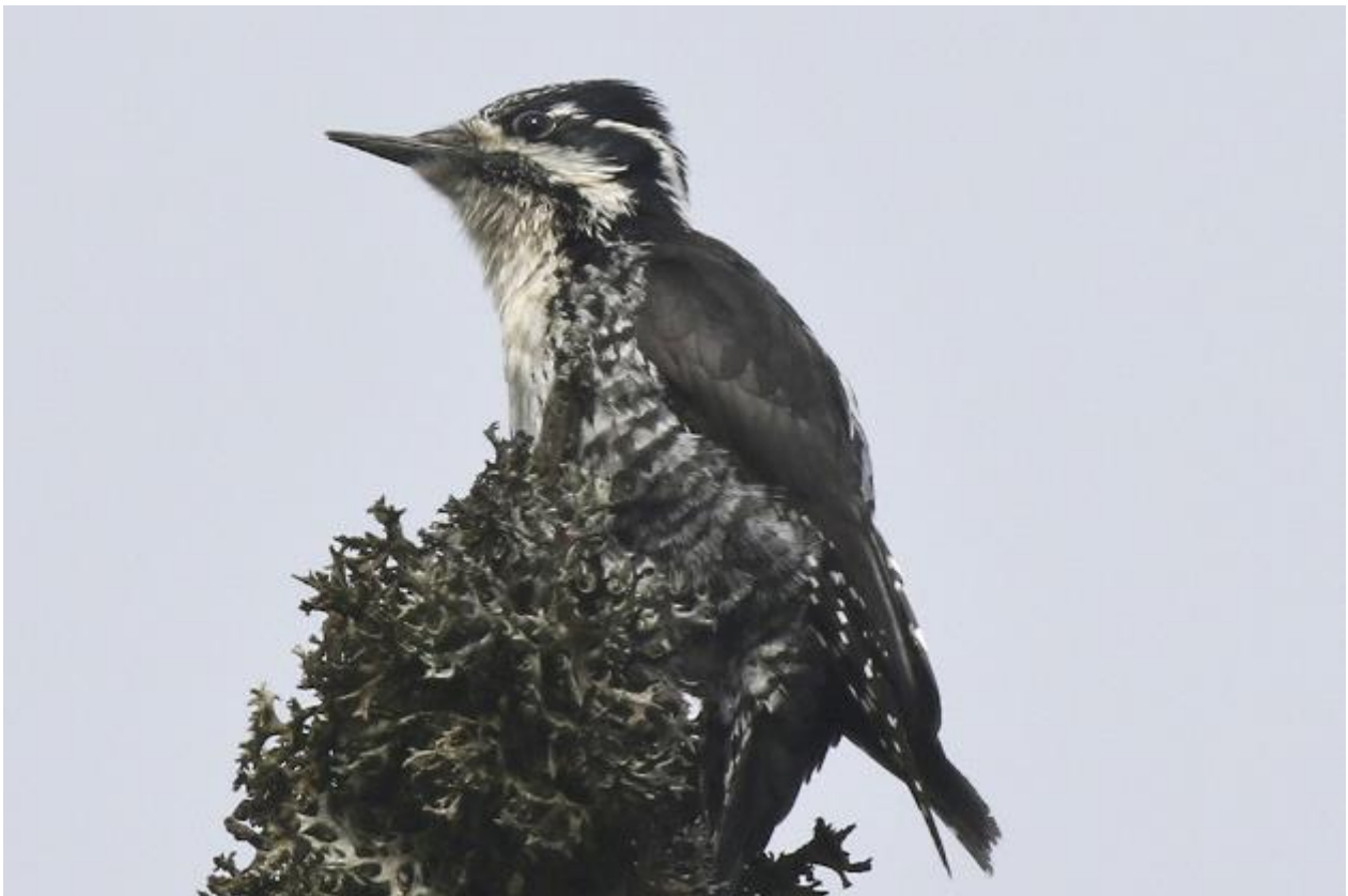
Female Three-toed Woodpecker (tour participant Björn Johansson)

The walk back was easier in the good weather with more Firecrests and other common birds along the trail. We drove close to the peak and had a nice coffee and the nearby grassy area had a few displaying Water Pipits. We had lunch in a restaurant down in the valley and after that