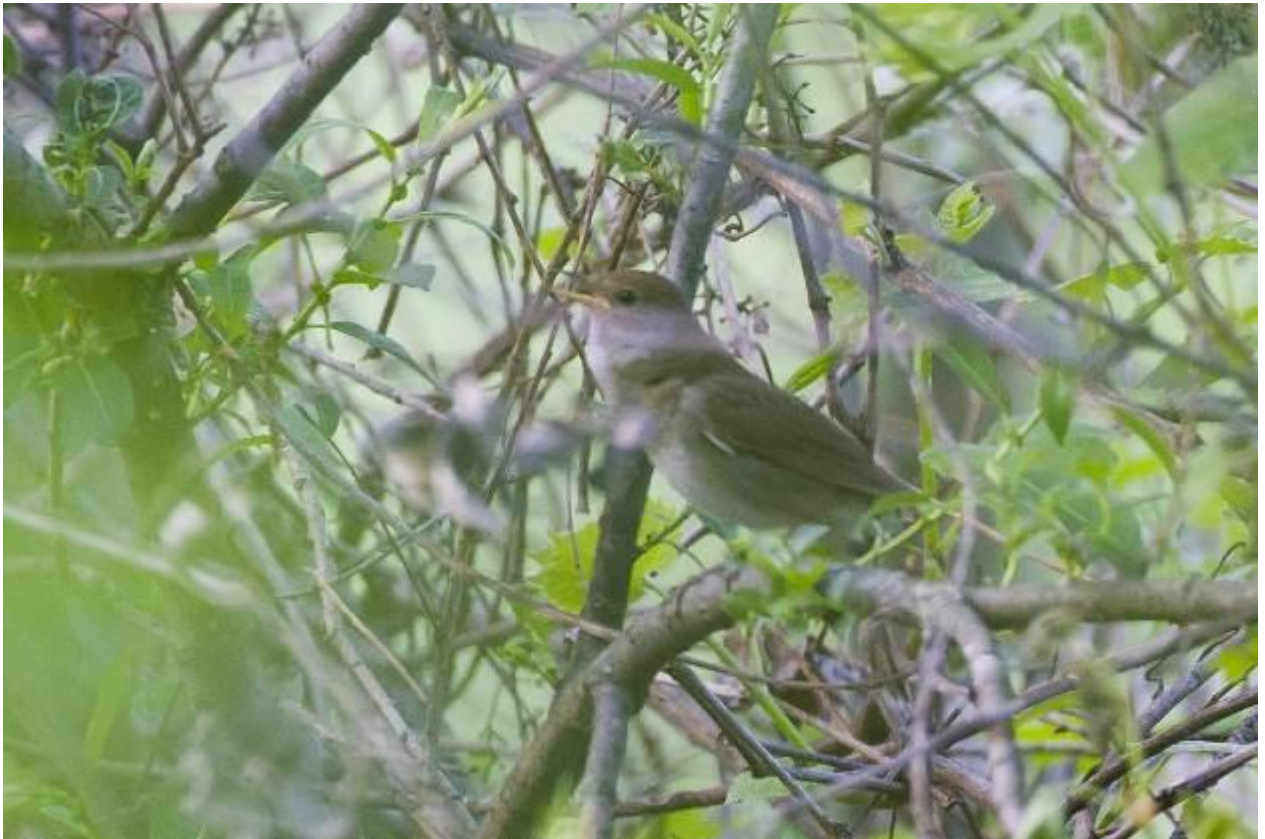
Singing Sombre Tit (top) and Thrush Nightingale (Simay Gábor)