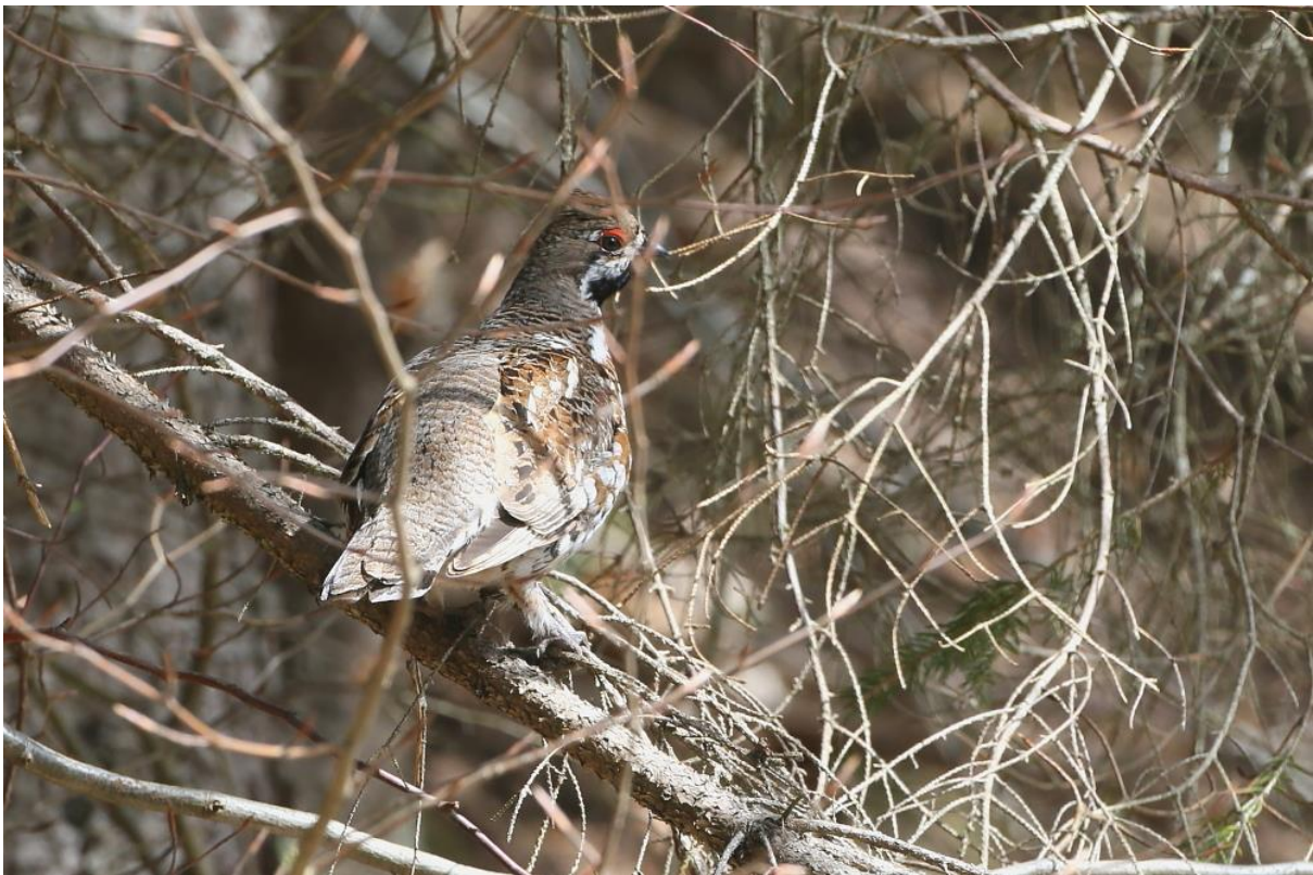
Male Hazel Grouse (János Oláh)

We had a Black Kite on the drive and in the afternoon we stopped for an Isabelline Wheatear – a rarity in Hungary, and a somewhat unexpected addition to our bird list. Though it was getting late and we still had some distance to cover to the hotel, we couldn't resist the temptation and stopped for birding by a fishpond system. We had very good views of a pair of Penduline Tits, plenty of Spoonbills were feeding in the shallow water and Pygmy Cormorants and Black-crowned Night-herons were flying around. Whiskered Terns were hunting for insects, while from the bushes Common Nightingales were singing away. It was a nice evening for sure. We drove to our hotel near Nádudvar and arrived in the dark.