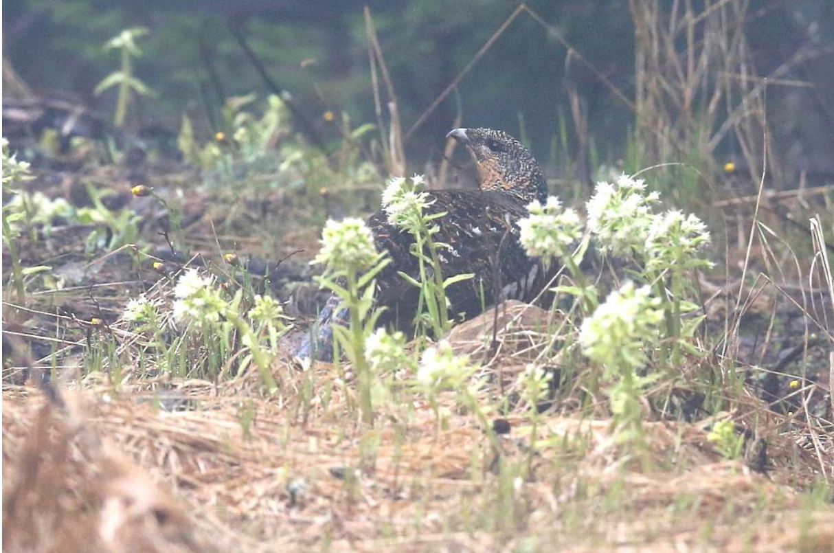
Roadside Western Capercaillie in the Hargita Mountains (János Oláh)