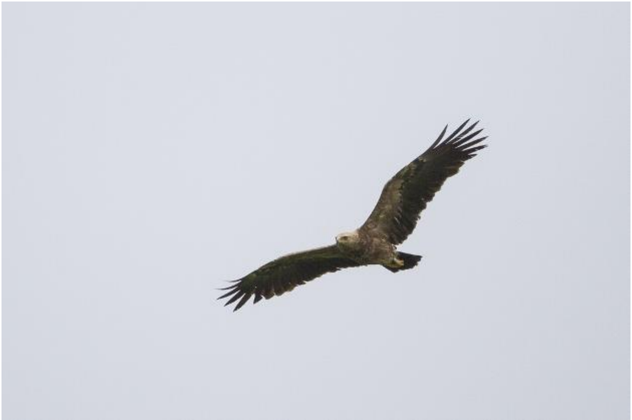
Lesser Spotted Eagle (Simay Gábor)

After we took a small forest road, we left our van behind and walked up on a forestry road into a nice old spruce-beech forest. The evergreen trees held plenty of Crested Tits and a few Bullfinches. After we heard a distant White-backed Woodpecker calling, we managed to find the female on a tree top and we had good scope views of it. No much later the male bird was also seen by some of us. After the struggle yesterday it was amazing to get such a good look of this rare woodpecker! Right after this a calling Hazel Grouse drew our attention. After some effort it was found and seen a couple of times, sometimes really well. It was a very good bird to get on our list! Again by early May they usually not calling much but the cold spring and the cold weather was helping with this bird. After this we tried hard to find Tengmalm's Owl, but we had no luck with this species. This year was - sadly - a particularly bad year for the small owls anywhere in the Carpathians. While searching for the owl, we found the nest hole of Black Woodpeckers and had great views of the pair. While a Nutcracker also turned up on a tree top. The lights had started to fade and it was time to walk down the road and drive to our hotel near Dobsina.