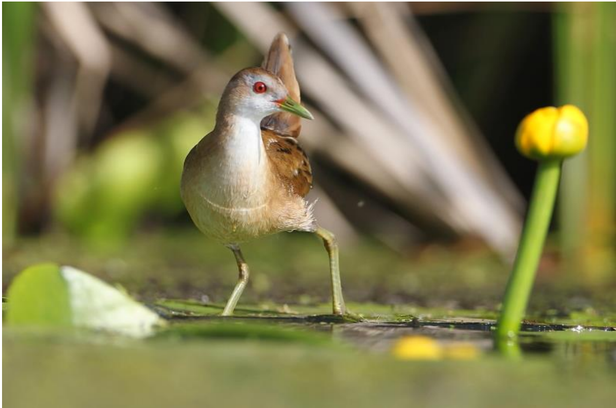
Female Little Crake

In the afternoon we saw another Saker and also a fine Eastern Imperial Eagle, this time in flight. A few Black Terns were flying around and also Garganeys and a superb male Little Bittern were seen too. We spent a lot of time trying to find a Little Crake, but despite we heard a few we had only glimpses of them. Late afternoon however they became more active and eventually we had fantastic and close views of three different birds! This is a real Central European specialty! This great day was finished in a wine cellar where we tasted plenty of different kind of local (Tokaj) wines and had a fantastic dinner too. From the vineyard we drove back to the hotel, where we decided to skip the bird list in such a late hour and leave it for tomorrow morning.