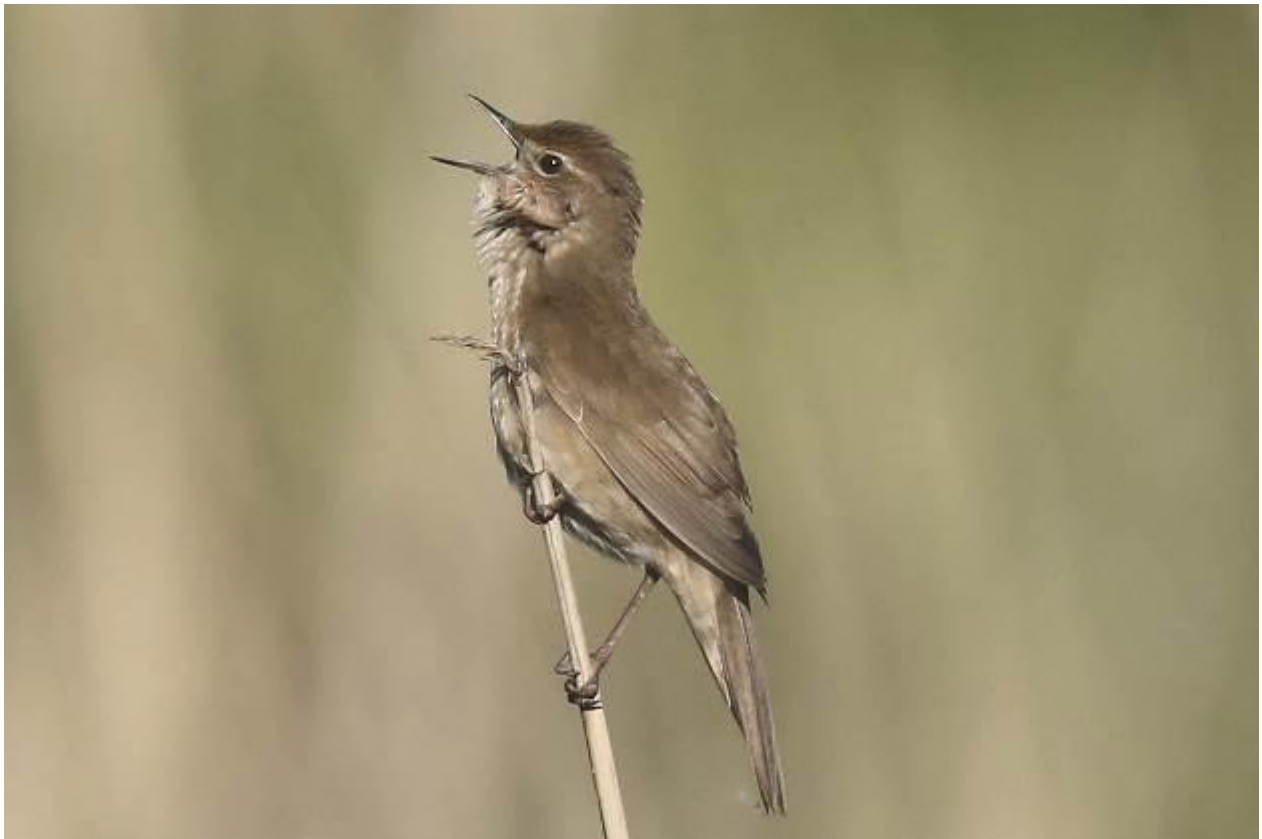
Singing Savi's Warbler

The group members arrived from different locations and the meeting point was the Liszt Ferenc Airport in Budapest. From here, we took the M3 motorway till Miskolc and from there to the Zemplén Hills. These gentle hills are found in north-eastern Hungary with beech and oak forests, wide valleys and foothills with grasslands, vineyards and orchards. On the way we had one short stop, where we had our sandwiches and saw our first species to mention: a few Crested Larks – typical species of the parking areas or garages – and a somewhat distant adult Eastern Imperial Eagle in the scope. Our first proper birding stop was in a quarry where we were looking for Eagle Owl. The female was quickly found, but unfortunately it moved too behind a bush. Despite we waited there for a while it didn't appear again. European Turtle Doves, Red-backed Shrike and Hawfinches were also seen here. On a nearby area later on, we found another adult Eastern Imperial Eagle much closer than the first one, and also a perched Saker Falcon. The nearby marshy habitat produced Savi's, Grasshopper and Great Reed list. Warblers. A pretty amazing first afternoon! As we did the birding till dusk, it was already dark when we arrived to our hotel deep in the Zemplén Hills.