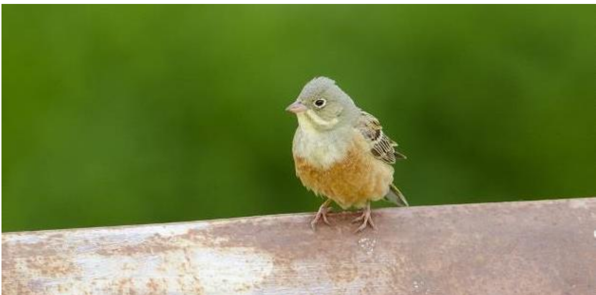
Ortolan Bunting (Simay Gábor)

A grassland area gave us a soaring Long-legged Buzzard (a rare breeder of the Hungarian grasslands) and also a Hobby and a Hoopoe. Our next stop was by some reservoirs where we had our picnic lunch. We had no time for checking the huge lakes thoroughly, but five Red-necked Grebes were spotted among the many Greater-crested Grebes. We also saw singing Ortolan Buntings and a Tawny Pipit made a short appearance too. A soaring Short-toad Eagle gave better views than the one in the Zemplén Hills and was a very welcome addition!