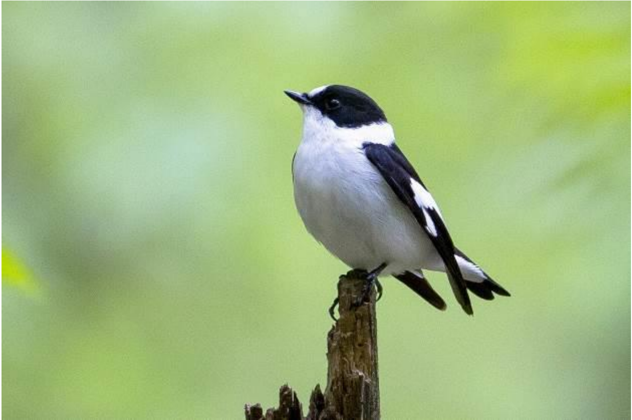
Collared Flycatcher in the Zemplén Hills (Simay Gábor)