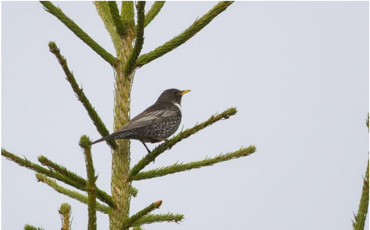
Ring Ouzel (Simay Gábor)

Eurasian Blackbird Turdus merula : A common species, recorded on 12 days.