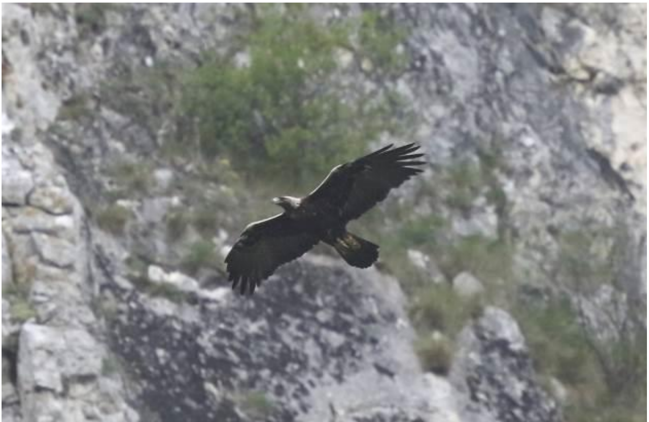
Golden Eagle near Torockó

Golden Eagle Aquila chrysaetos : Three birds were seen in Transylvania.