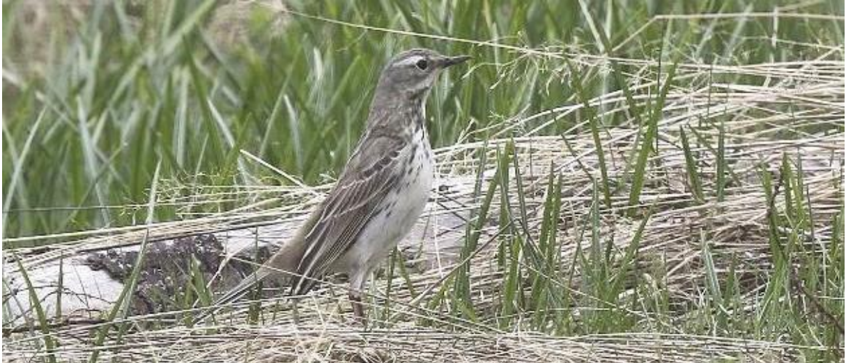
Water pipits were displaying in the Hargita Mountains (tour participant Björn Johansson)